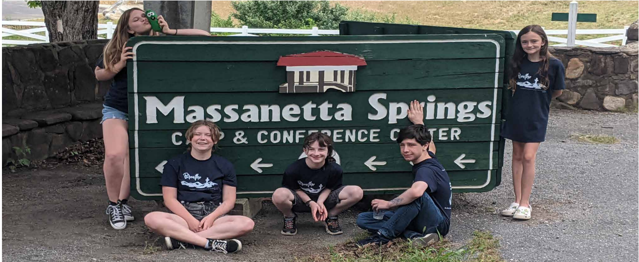
Youth checking in to the Massanetta Conference!