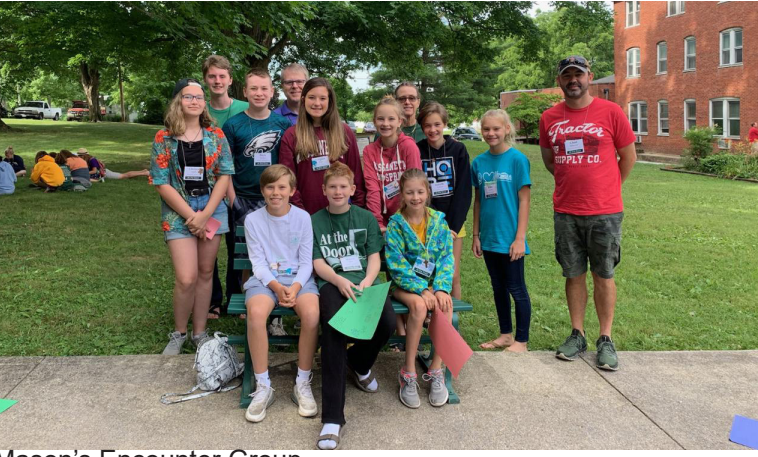
Mason's Encounter Group