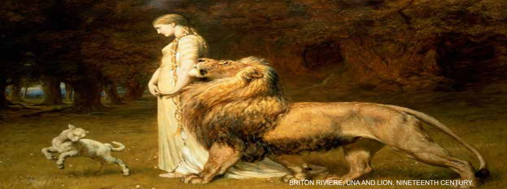
BRITON RIVIÈRE, UNA AND LION, NINETEENTH CENTURY